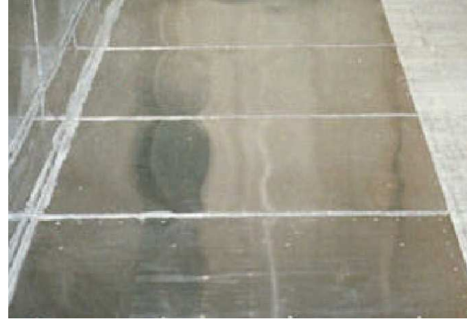
Aaronia Magnoshield® made from Mu-metal allows quick and easy large-area magnetic field screenings.

Installation is performed edge to edge to build a completely closed surface.